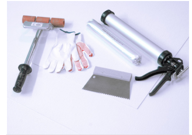
Accessories - Direct fix

*Please refer to our data sheets and installation instructions