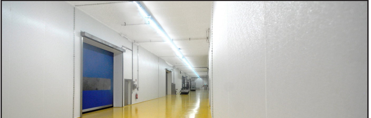
Installations in the corridor area of a dairy